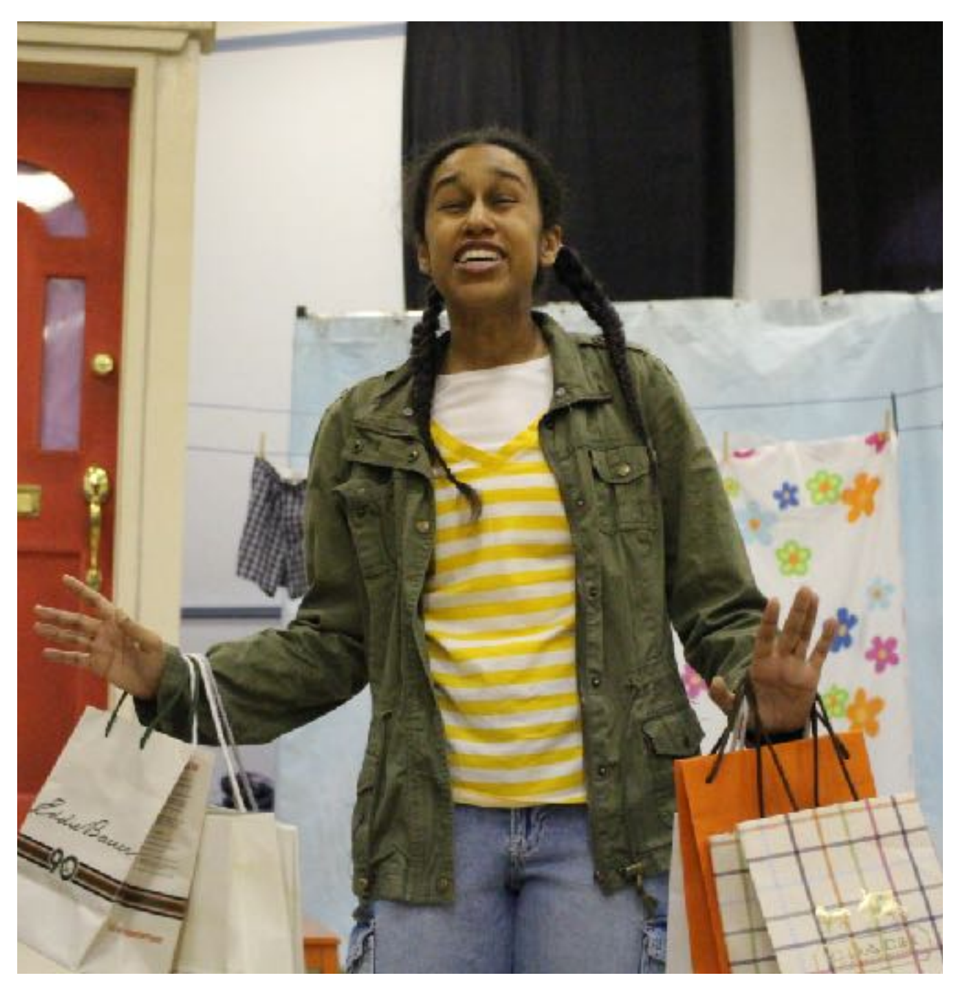
Image description: Shasta has a big smile. She holds many shopping bags and her eyes are closed.

Thank you for watching The Money Tree. We hope you enjoyed the play!