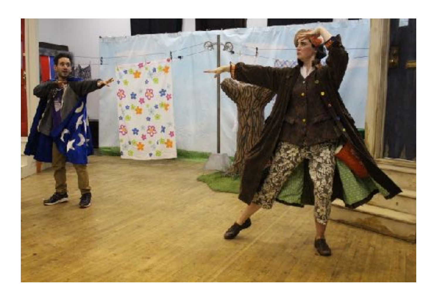
Image description: Simon and the Mysterious Stranger stand opposite each other with their arms stretched towards the other person.

To book a performance please contact Alice Keane at <a href="education@roseneath.ca">education@roseneath.ca</a>